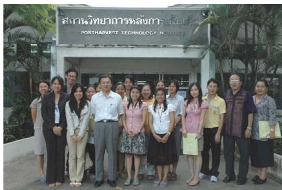
Short course at Chiang Mai University